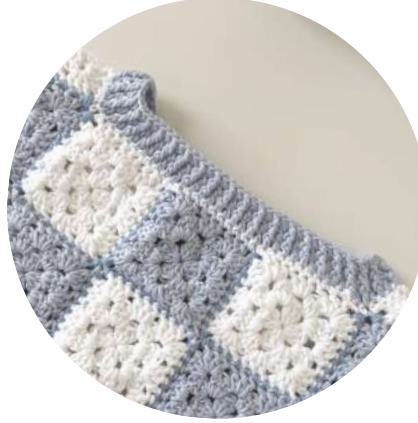
THE NECK LINE